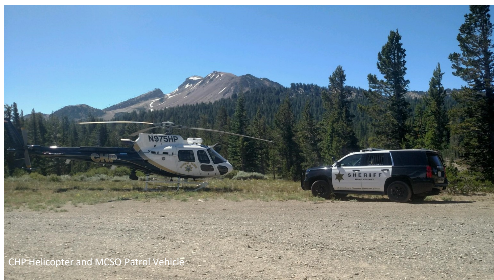
CHP Helicopter and MCSO Patrol Vehicle

As usual, many of our visitors got themselves into situations they were unable to extract themselves. Thanks to our deputies and our Search and Rescue, we pulled people out of sand, water, mud and mountains. Many thanks to the California Highway Patrol's helicopters for assisting on many rescues and literally plucking people off of mountainsides.