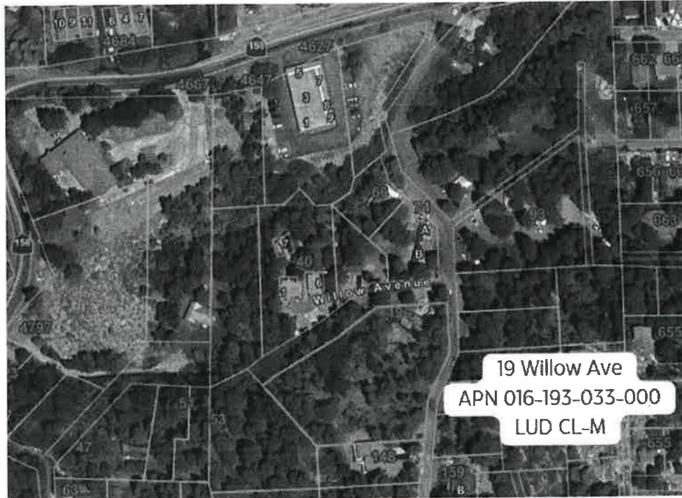
Figure 1: Overhead View of Parcel and Vicinity

PO Box 8 Bridgeport, CA 93517 760-932-5420 phone, 932-5431 fax www.monocounty.ca.gov