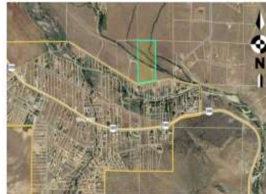
Project location highlighted in blue. 324 North River Lane (APN 002-460-015)