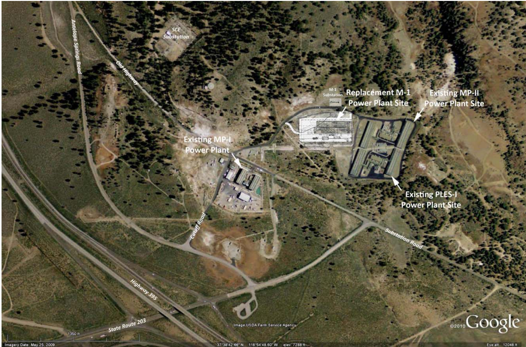
Figure 2: Existing Casa Diablo Geothermal Complex and Proposed M-1 Replacement Plant Site